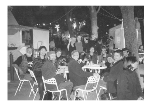
The Formal 2001 AGM in an informal setting...