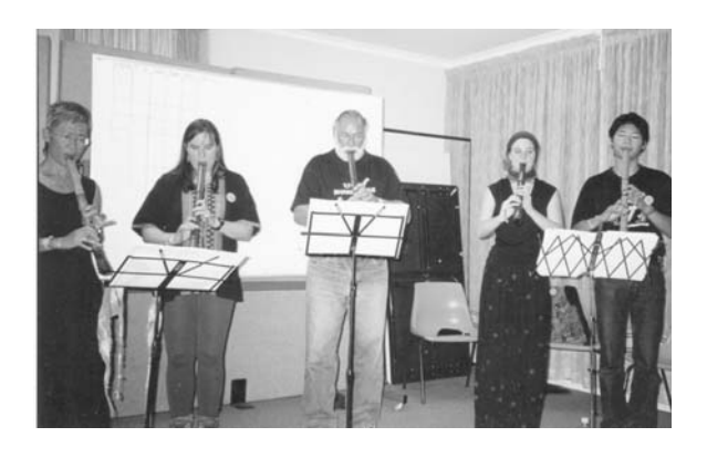
One pointed concentration ..