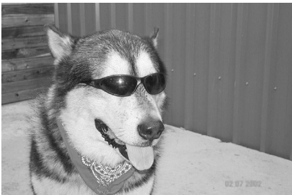
Does a Dog have Buddha nature?

I had a second opportunity at another school nearby. I had spent some time now at the clinic with children approaching me and making their own music, shyly sometimes; I would hear it as a trail as they walked away. This time I told a story of how the shakuhachi was at one time carried as a weapon and that it can only be played by men in some cultures. After playing for a little while I passed the flute around for the children to try to get a sound out of it. On that day no-one else could get a sound, their teacher included who, having some experience in making homemade instruments was keen to get information on making PVC flutes. This was made simple via the internet. I remember my surprise on finding my beginners flute locally by posting a message to an e-mail group. The previous owner had found it in Japan and generously passed it on to me. I continue to be surprised at the places the flute takes me.