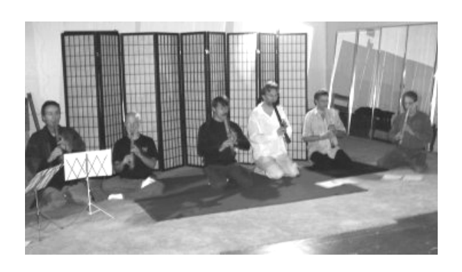
Note sitting in seiza position [read following short item on ASS - Ed]