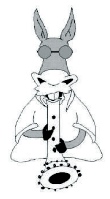
Ass retro look by graham