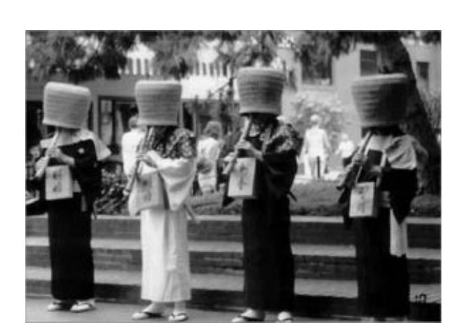
Which one is Riley?

If you don't make an effort to learn the characters and terminology you will be forced to translate first, then train, thus losing valuable time in playing