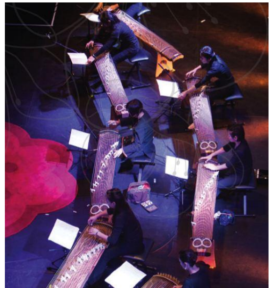
The Koto ensemble in concert