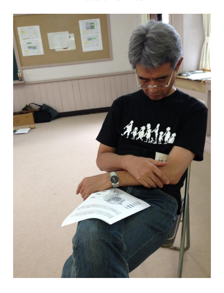
Late nights and early mornings ....