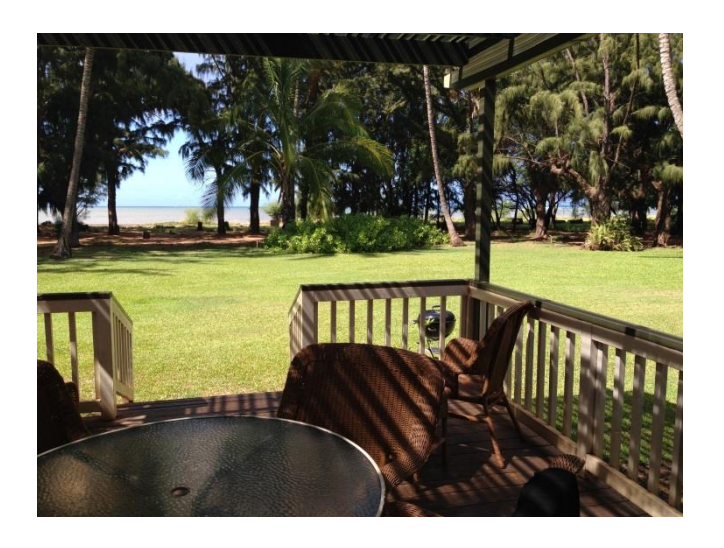
Location of Workshop