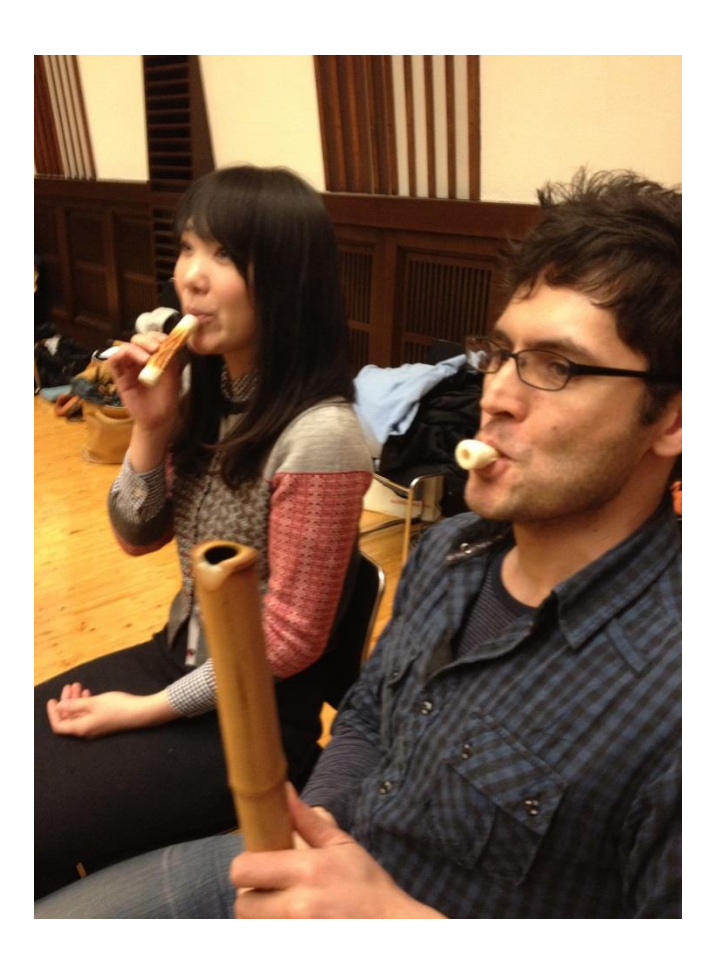
Warming up for a chikuwa solo