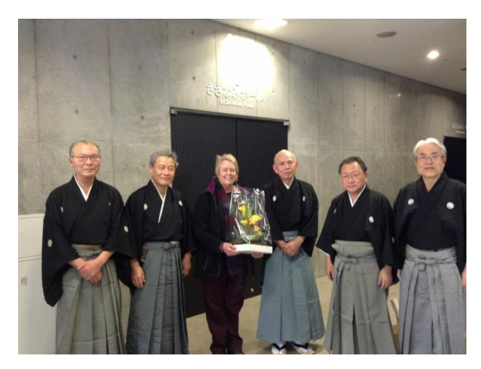
After the concert.