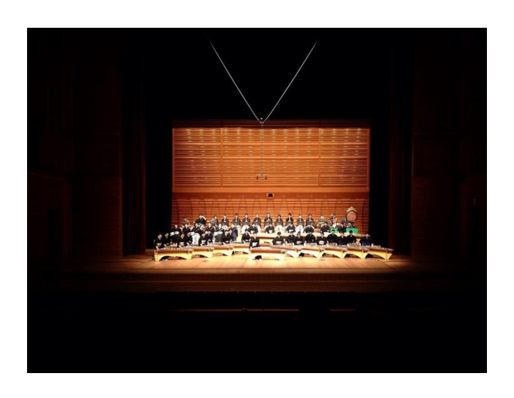
Performing Michio Miyagi's Etenraku