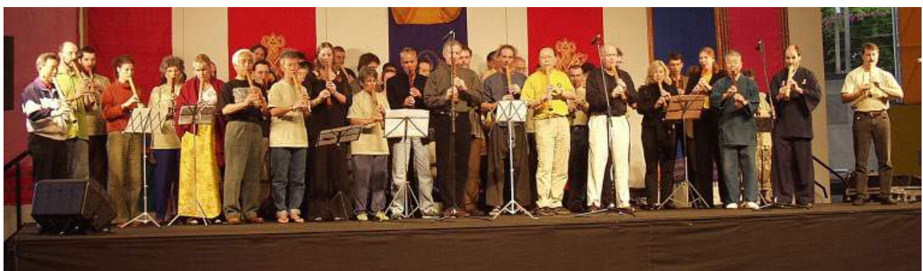
ASF 03 Southbank, Brisbane