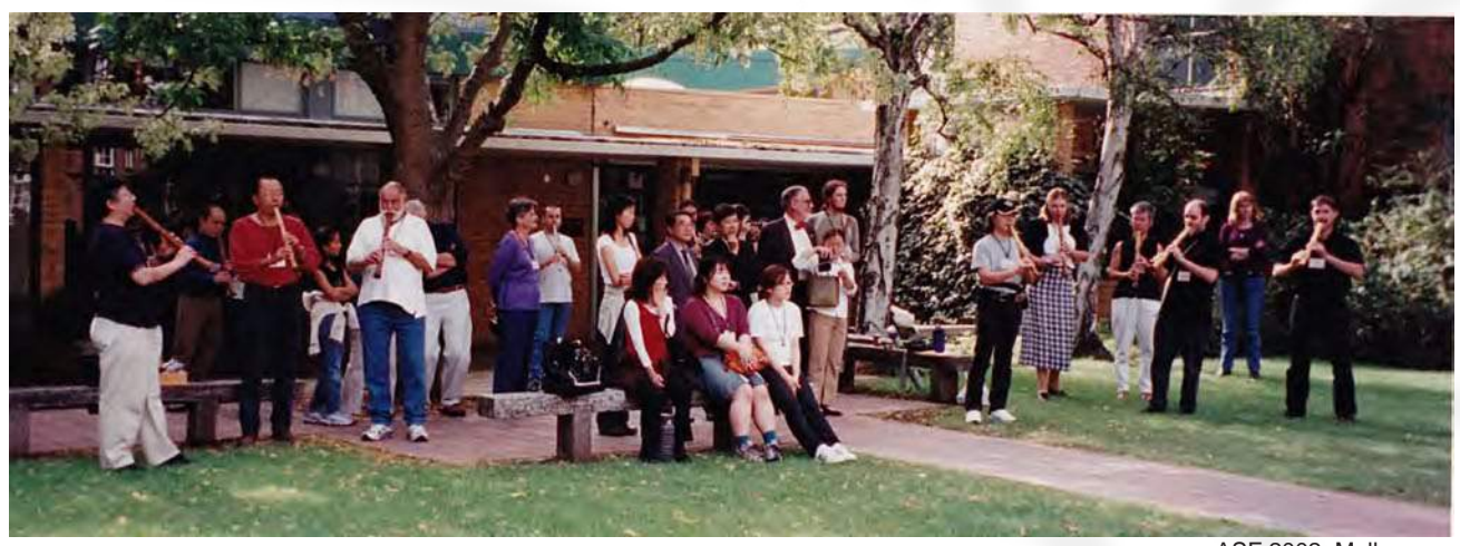
ASF 2002, Melbourne