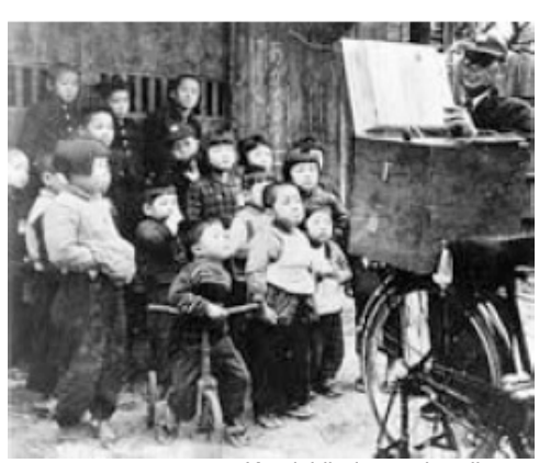
Kamishibaiya and audience

Kamishibai ('paper drama') is a form of storytelling dating from the 12th century, in which kamishibaiya (storytellers) used illustrated boards to tell fables. The kamishibaiya would, at first, use hyoushigi to announce their arrival at the village, attracting children to sell them candy. Those who bought the most candy would get front row seats. Kaien no oto would be performed to build tension when a performance was about to begin, or to maintain tension when introducing a chapter or new section.