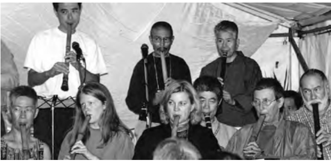
ASF 2000 concerts

The first two ASF organised under the ASS banner were held in Springwood, in 1998 and 1999. Over 90 people attended ASF1999. That one remains the best attended of all the Australian shakuhachi intensive retreats. The ASF99 public concert, held in the old Springwood Civic Centre, was nearly sold out, with over 1000 in the audience.