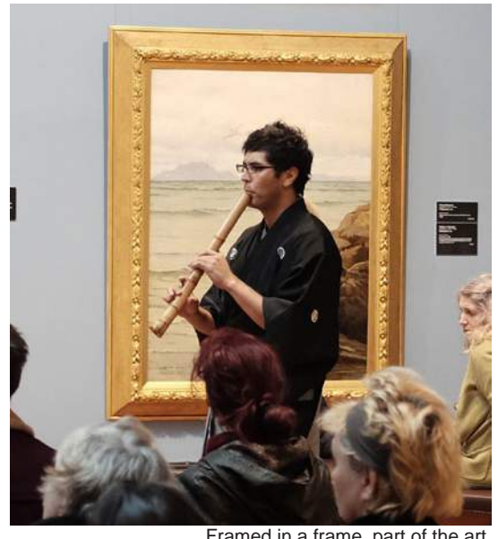
Framed in a frame, part of the art