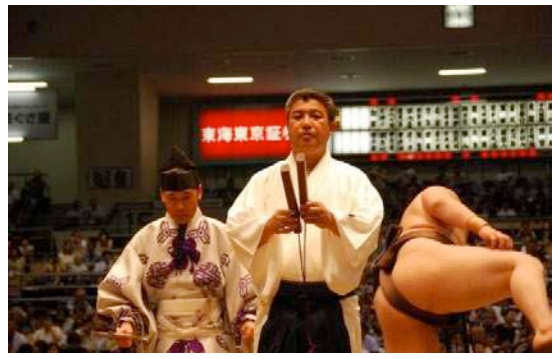
Hyoushigi at sumo tournament

the hands of old guys walking around the streets of Japan at dusk, warning people to be careful of fire, and to close their shutters.